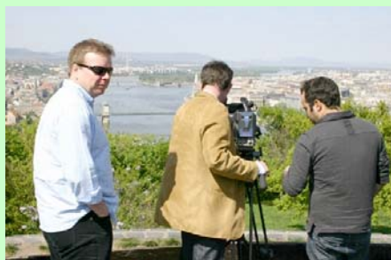
The film crew get an 'overview' of Budapest